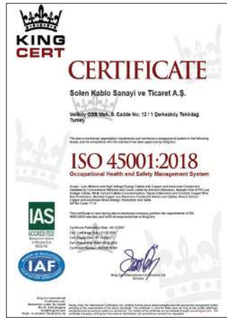
ISO 45001:2018 Occupational Health and Safety Managements System. 12.2021