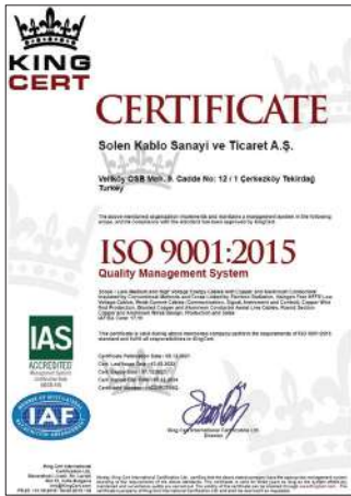
ISO 9001:2015 Quality Management System. 12.2021