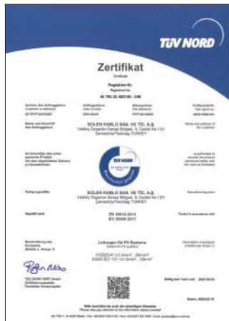
TUV NORD // 03.2022 Cables For PV Systems Sertifika No / Certificate No. : 44 780 22 406749 - 049