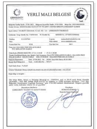
Made in Turkey