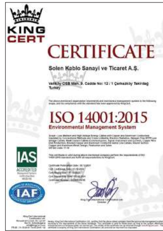
ISO 14001:2015 Environmental Management System 12.2021