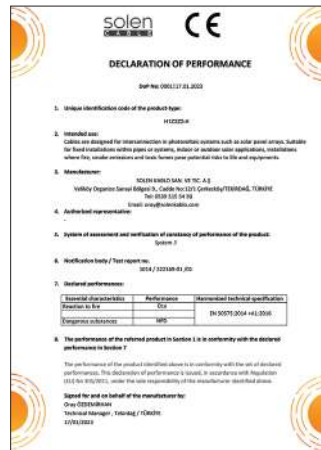
Conformité Européenne CPR Reaction to Fire with with class: Dca - s1a,d2,a1