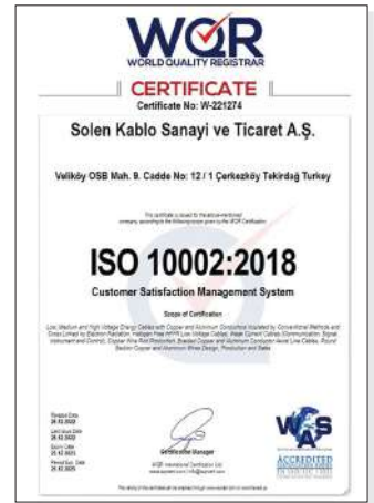
ISO 10002:2018 Customer Satisfaction Managements System. 12.2021